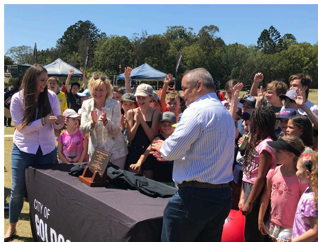
Image: Coplick Family Sports Park plaque unveiling.

Coplick Family Sports Park Open Day – There was a healthy turnout to commemorate the official opening of Coplick Family Sports Park on Thursday 3 October with 295 children participating in the ninja warrior obstacle course and the Rotary Club of Currumbin Coolangatta Tweed Inc. giving away 460 sausage sandwiches.