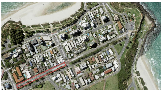
Image: Road Reconstruction, Boundary Street

Road reconstruction, Boundary Street – Road reconstruction works along Boundary Street (Hill Street to Ward Street) are ongoing including the replacement of footpaths, vehicle crossovers, water supply infrastructure, and kerb and channel; and the removal of retaining walls and open drainage channels. Works are due to be completed February 2020 (weather permitting).