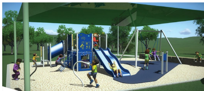
Image: Joe Doniger Park playground upgrade concept

Joe Doniger, Playground upgrade – works are scheduled to commence on 11 November to upgrade the playground at Joe Doniger Park, Bilinga.